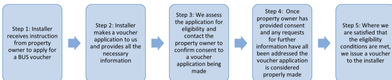
Figure 2 – Stage 1, voucher application process

5.7. The first stage of the BUS application process is the voucher application. Installers can create and submit voucher applications online via the digital BUS portal. 96